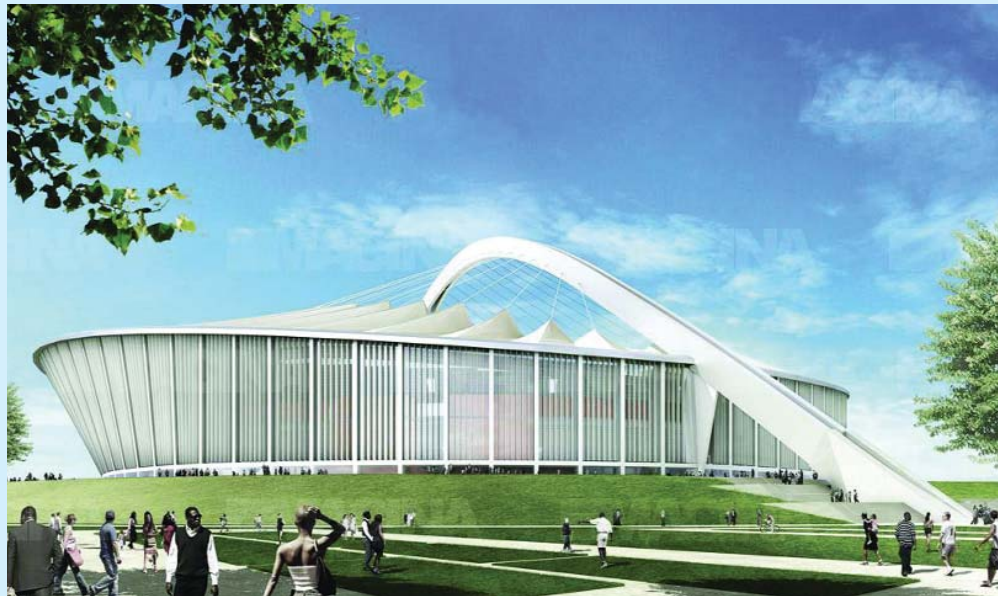
An artist's impression of the Moses Mabhida Stadium in Durban which will be constructed for the 2010 FIFA Football World Cup

Automated silicone dispensing system increases quality while reducing costs, cleaning time and waste