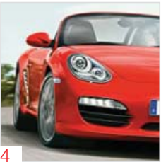
4 Sealing systems