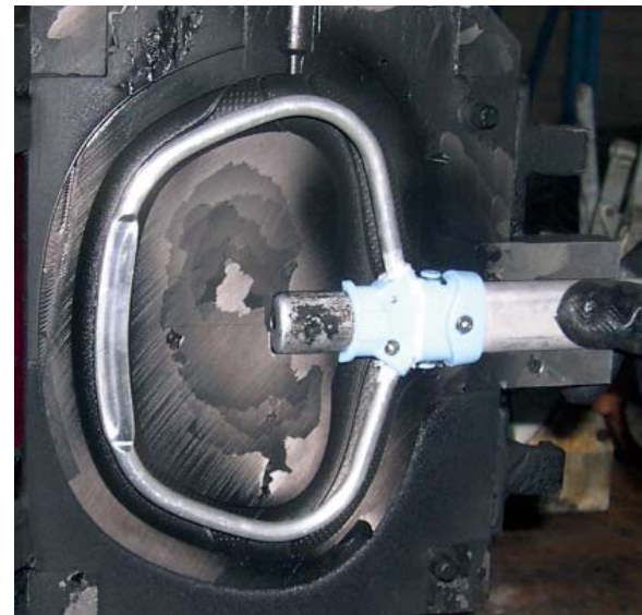
The insert is loaded into the mould prior to the injection of the polyurethane foam

However, in this case, the ELDO-MIX was fitted with a DOPAG static/dynamic mixing and dispensing valve, reducing wastage and eliminating the need for environmentally unfriendly and costly flushing solvents, resulting in cost savings whilst producing perfect mouldings.