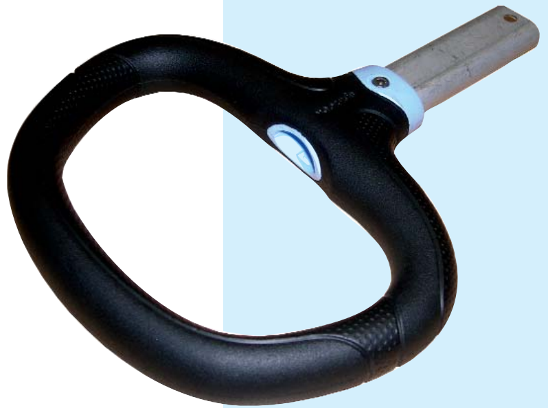
The finished component with its integral skin moulding

Simply put, a two component polyurethane reactive foam is injected into a mould after an insert