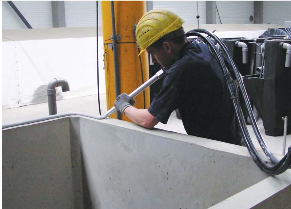
Mixed adhesive is laid onto the mating flange of the lower half of the tank

DOPAG SILCO-MIX improves quality and saves money for water tank manufacturer