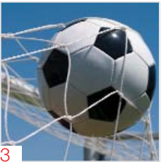
3 Lighting up the World Cup