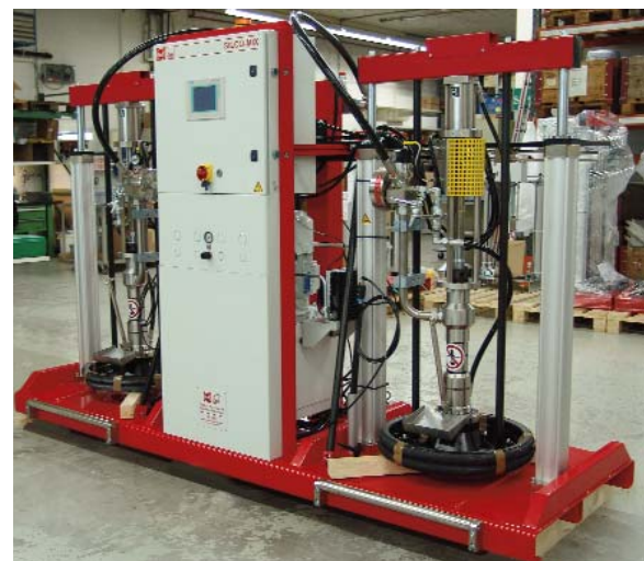
DOPAG SILCO-MIX H200