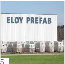
5 Cast in concrete