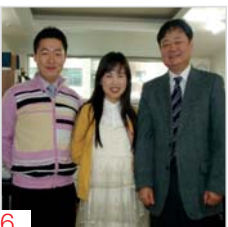
6 News and Events