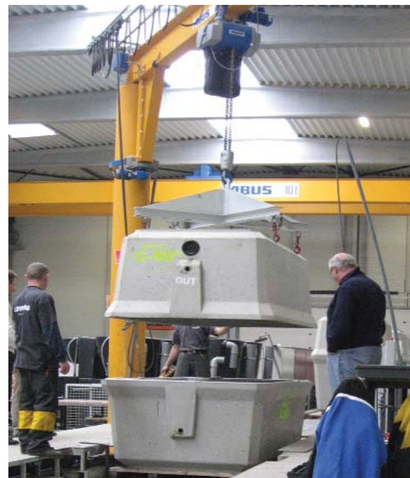
The upper half of the tank is lowered into position

Presently, the bead of adhesive is applied manually, but Eloy Prefab plan to automate the application process in the future, further adding to the excellent quality of the joint.