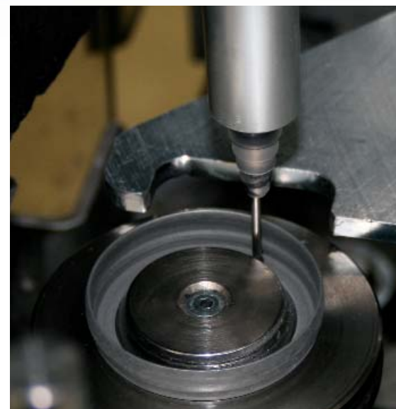
Mixed FKM fluoroelastomer is automatically dispensed into the seal housing

Dispensing takes place via a DOPAG twin valve, which features a “snuff-back” facility in order to ensure that mixed material does not drip from the outlet after dispensing is complete. A disposable plastic static mixer is used to homogeneously mix the two components.