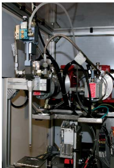
DOPAG ELDO-MIX 603

Worldwide headquarters are located in the town of Hoisdorf, near Hamburg, where the emphasis is on the production of seals that require metal to elastomer bonding.