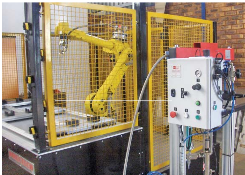
The dispensing cell featuring a DOPAG P200 pump, automatic dispensing valve and diaphragm material pressure regulator mounted onto a 6 axis robot