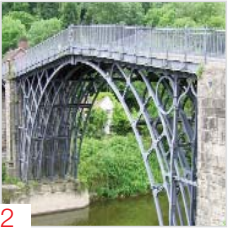
2 The birthplace of industry